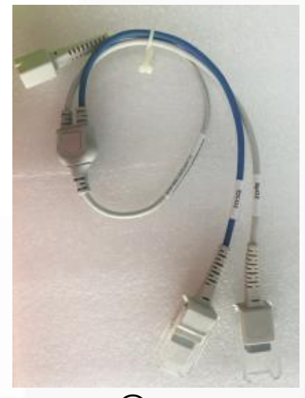
Connection Cable (SpO2+ETCO2)