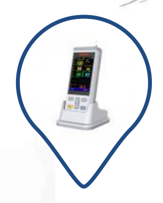
North American and Latin American area